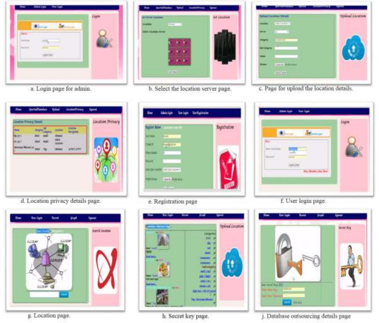
Figure 2: System Implementation execution pages.

importance and more details compared to user really needs. Within this paper, we advise a person-defined privacy grid system known as dynamic grid system (DGS) to supply privacy-protecting snapshot and continuous LBS. The primary idea is to put a semi trusted 3rd party, called query server (QS), between your user and also the company (SP). QS only must be semi-reliable because it won't collect/store or perhaps get access to any user location information [7]. Semi-reliable within this context implies that while QS will attempt to look for the location of the user, still it properly performs the straightforward matching procedures needed within the protocol, i.e., it doesn't modify or drop messages or create new messages. An untrusted QS would randomly modify and drop messages in addition to inject fake messages, and that's why our bodies are dependent on the semi-reliable QS. The primary concept of our DGS. In DGS, a querying user first determines a question area, in which the user feels safe to show the truth that she's anywhere between this question area. The query area is split into equal-sized grid cells in line with the dynamic grid structure per the consumer. Then, the consumer encrypts a question which includes the